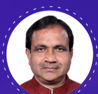
CHIEF GUEST Bhagwanth Khuba Minister of State (Chemicals & Fertilizers) Ministry of Chemicals and Fertilizers Government of India